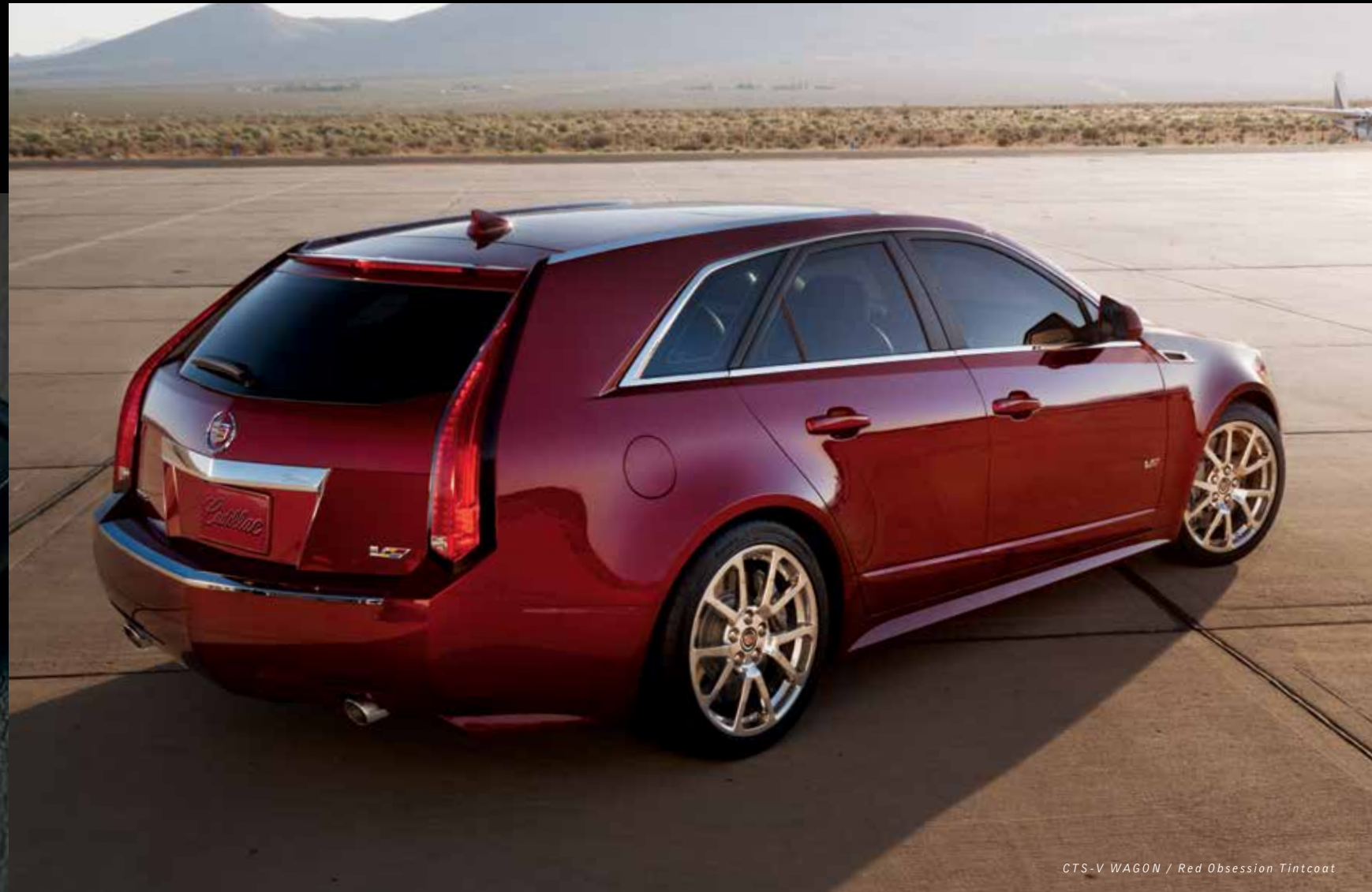
CTS-V WAGON / Red Obsession Tintcoat

By simply carrying a transmitter in your pocket or purse, Keyless Access unlocks the driver's door for you. Walk away, and it locks all the doors. With Adaptive Remote Start (automatic transmission models only), just press a button on the key fob; the ignition starts the engine and also activates the climate control system to perfectly adjust the interior temperature.